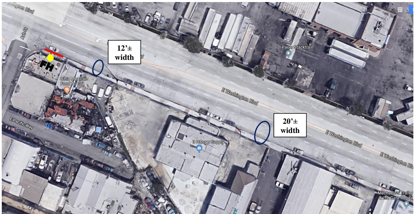
Lane Width Transitions and Proposed Red Curb Marking

The travel lane closest to the curb measures approximately 20-feet in width, which is more than adequate to accommodate both parked vehicles and moving traffic. However, near the intersection of Ash Street and Washington Boulevard, the width is smaller, measuring approximately 12-feet. For this area, Staff recommends that the curb be painted red approximately 10-feet in length in front of Washington Boulevard near Ash Street, which is also justifiable, given that there exists a fire hydrant in that vicinity and also traffic mobility will be enhanced. Please see below: