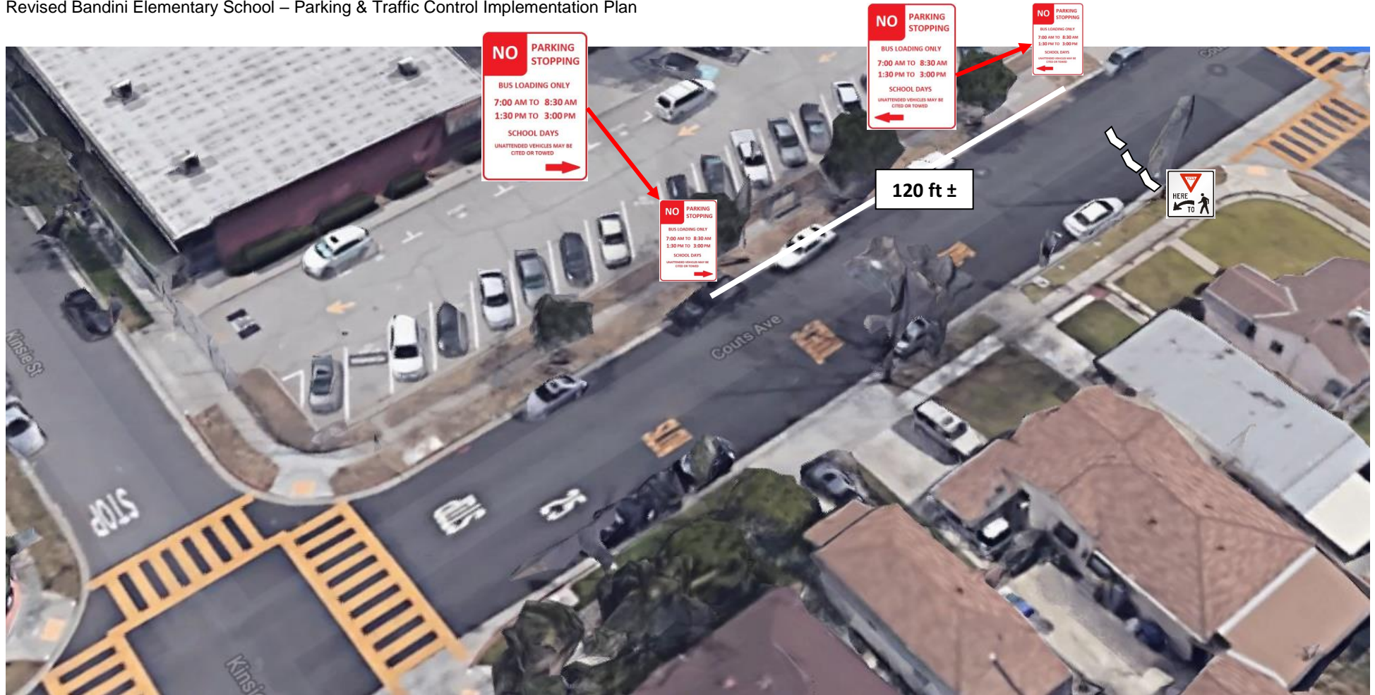
EXHIBIT 2A: Coutts Avenue Curb / Street Markings & Sign Placement (Proposed School Bus Loading & Unloading Zone) – AERIAL VIEW