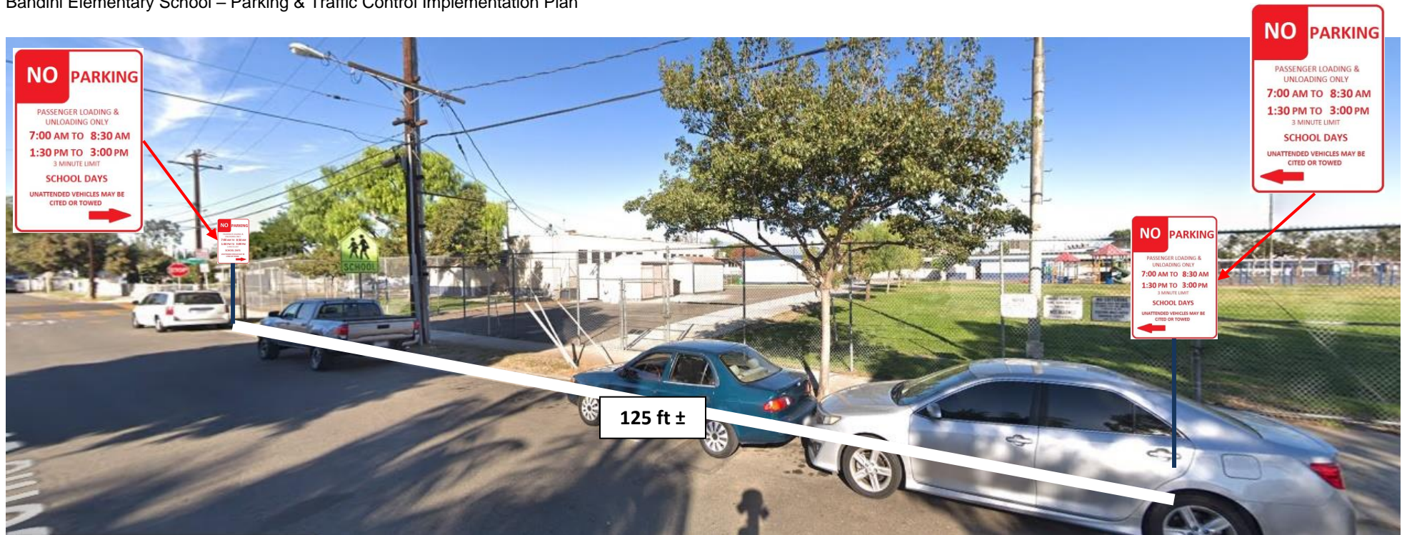
EXHIBIT 1B: Leonis Street Curb Markings & Sign Placement (Proposed Passenger Loading & Unloading Zone) – STREET VIEW EXHIBITS