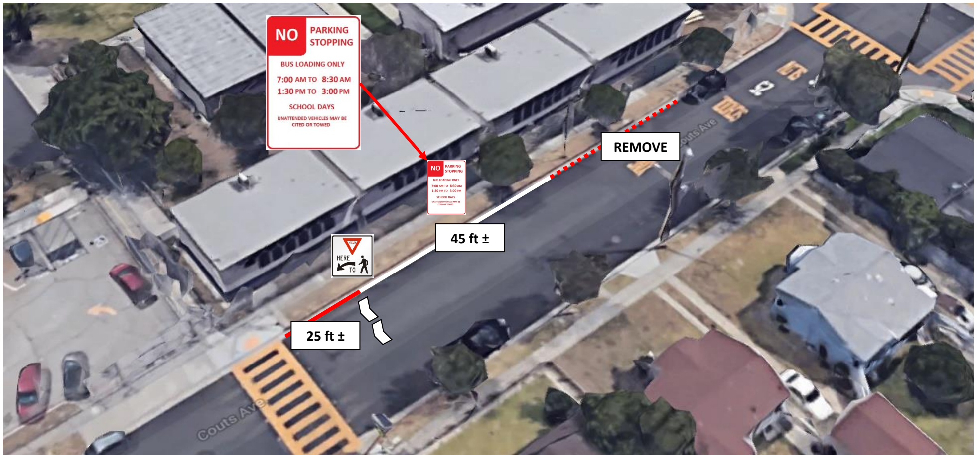
EXHIBIT 2A: Courts Avenue Curb / Street Markings & Sign Placement (Proposed School Bus Loading & Unloading Zone) – AERIAL VIEW EXHIBITS