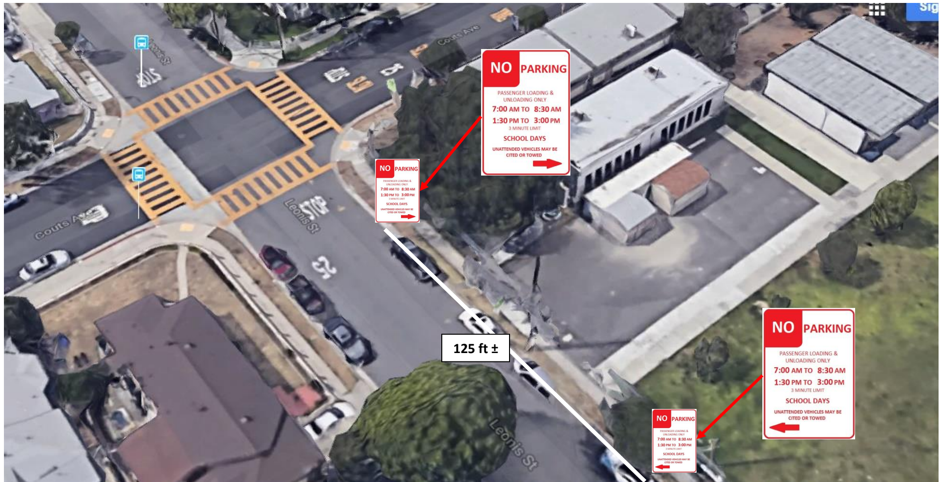
EXHIBIT 1A: Leonis Street Curb Markings & Sign Placement (Proposed Passenger Loading & Unloading Zone) – AERIAL VIEW