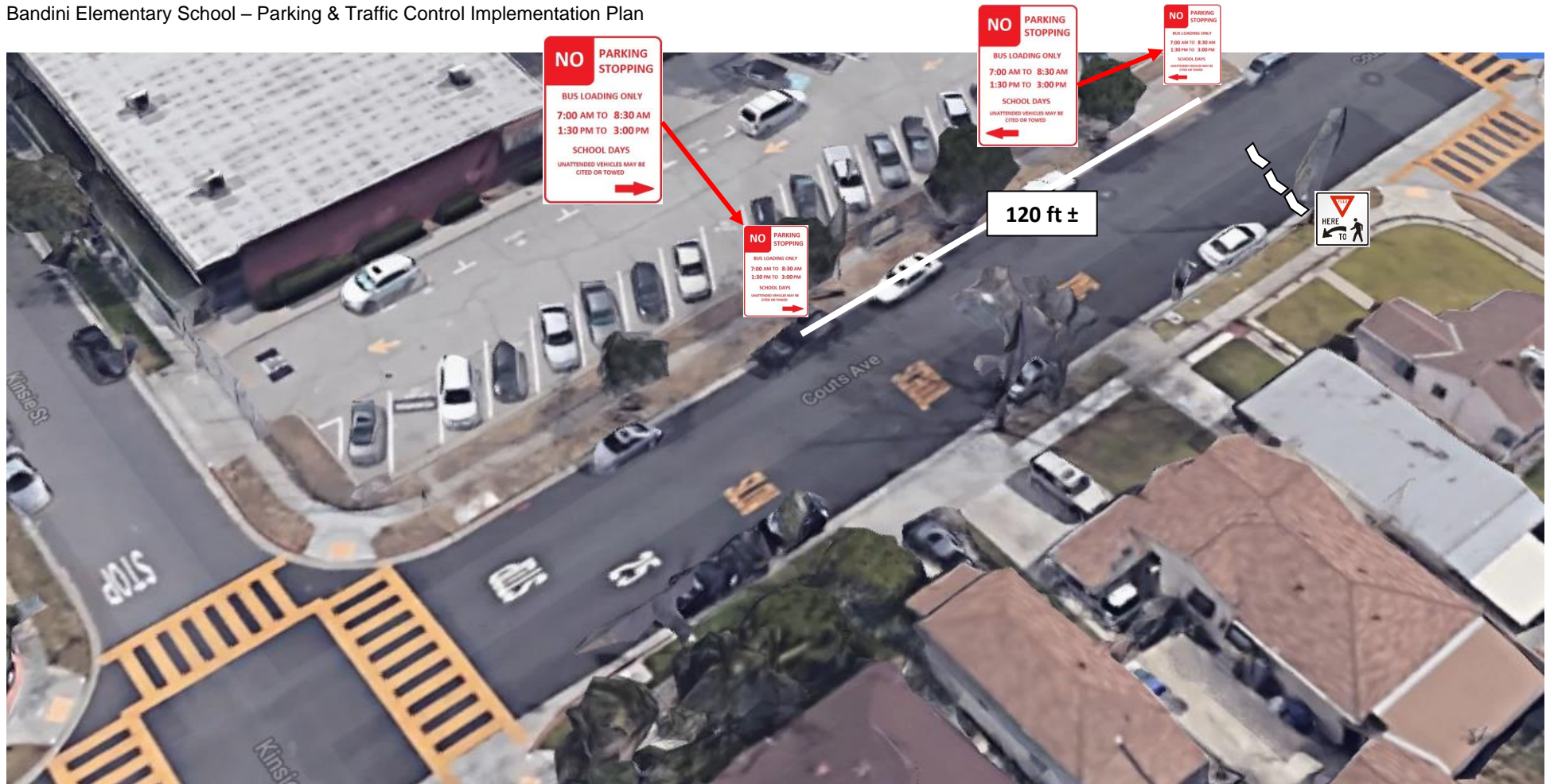
EXHIBIT 2C: Courts Avenue Curb / Street Markings & Sign Placement (Proposed School Bus Loading & Unloading Zone) – AERIAL VIEW EXHIBITS