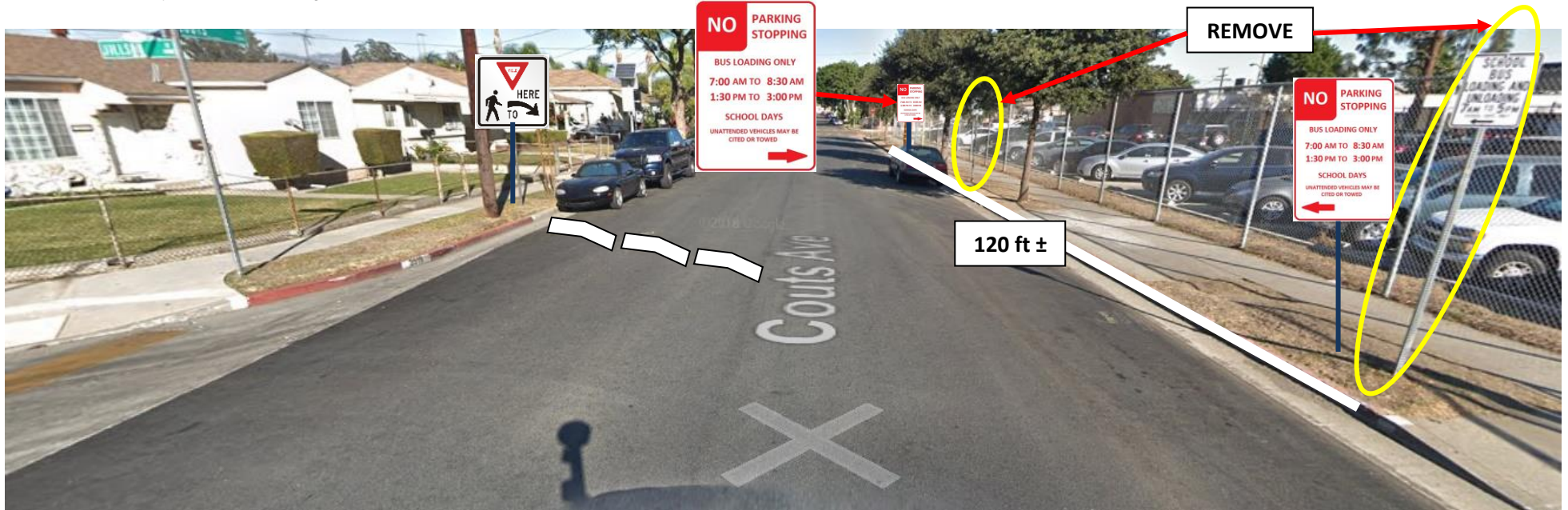
EXHIBIT 2D: Coutts Avenue Curb / Street Markings & Sign Placement (Proposed School Bus Loading & Unloading Zone) – STREET VIEW EXHIBITS