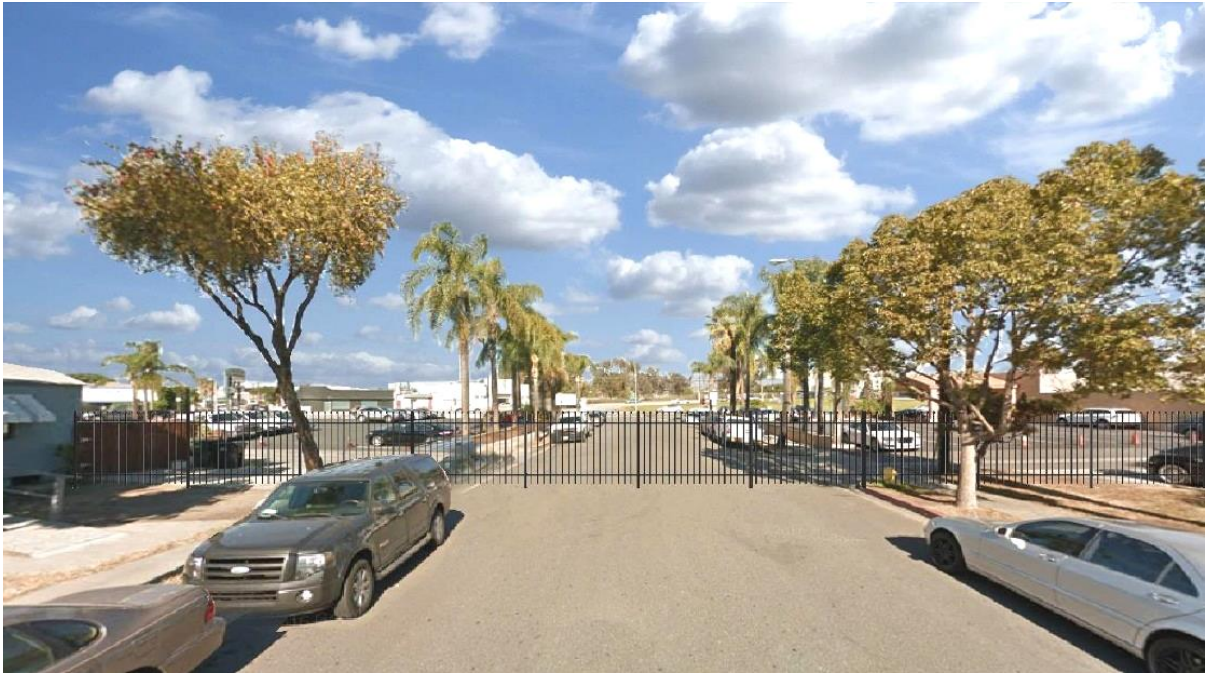
Looking northbound on Fitzgerald Avenue

The purpose of the fence is to prevent patrons from entering into the residential areas during peak business hours.