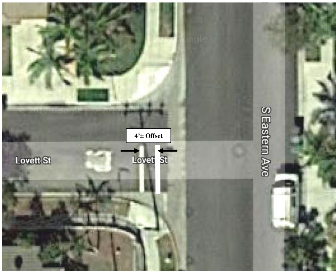
Relocation of STOP Bar at the End of Lovett Street (4-foot Offset): Eastern Avenue & Lovett Street