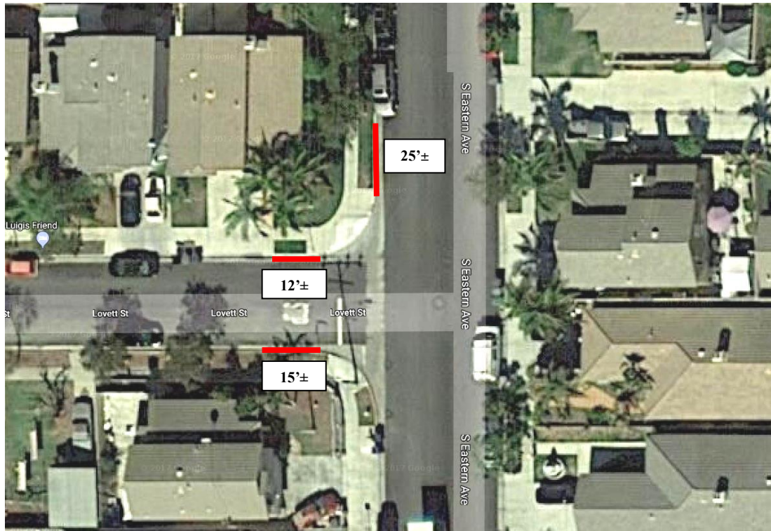
Location for Proposed Red Curbs: Eastern Avenue & Lovett Street