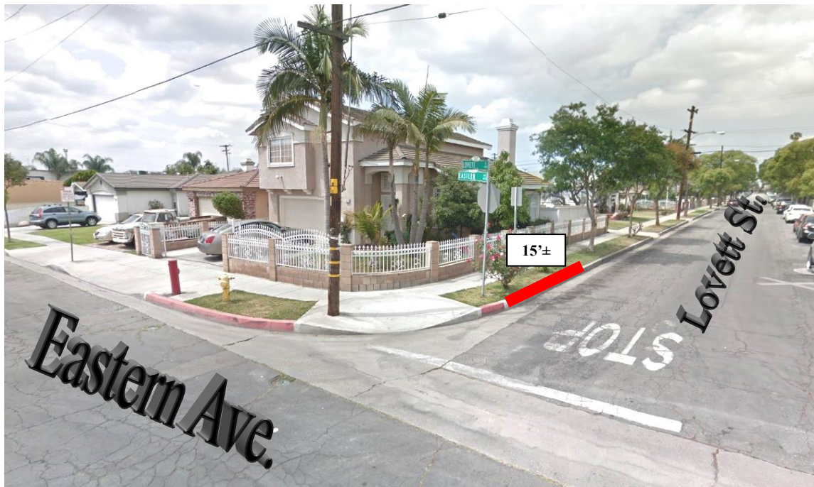
Proposed Red Curb along Lovett Street (southerly curb): Eastern Avenue & Lovett Street