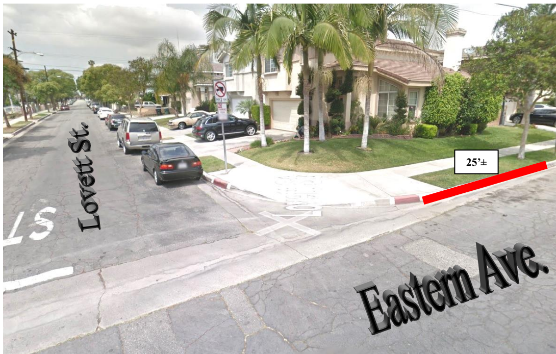
Proposed Red Curb along Eastern Avenue (westerly curb): Eastern Avenue & Lovett Street