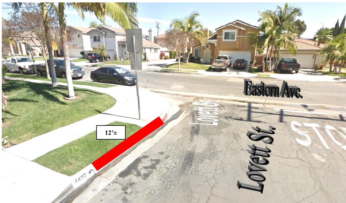
Proposed Red Curb along Lovett Street (northerly curb): Eastern Avenue & Lovett Street