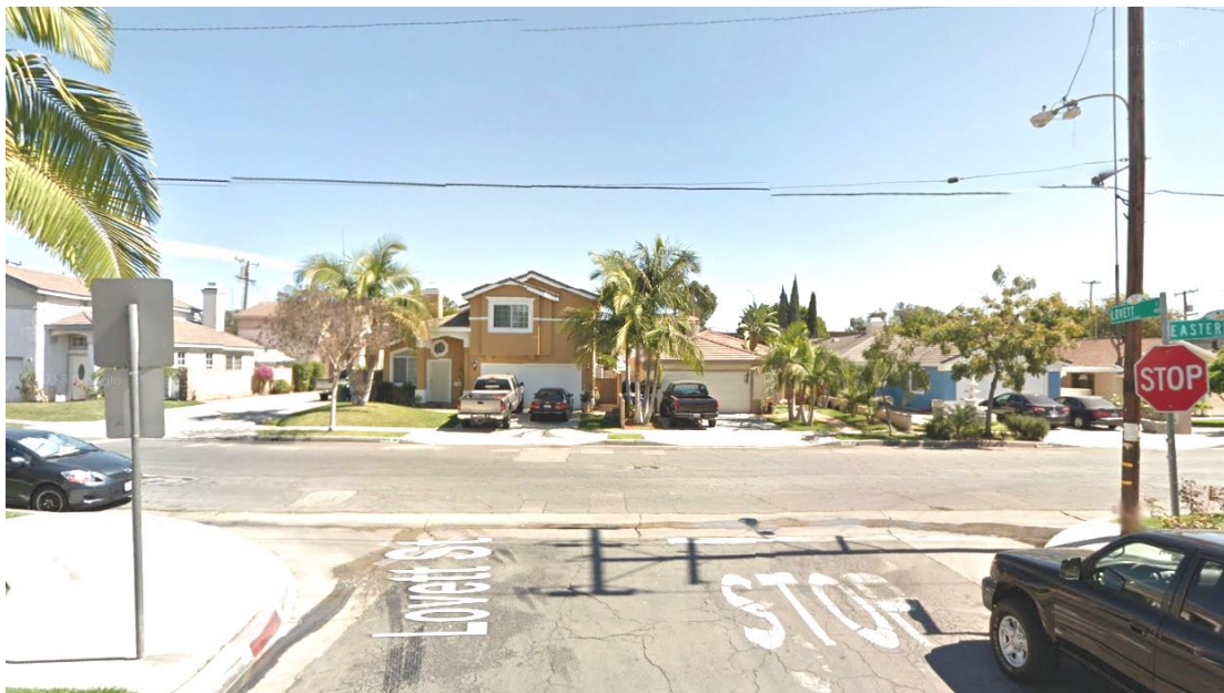
Sight Distance Partially Compromised due to Parked Vehicles near Curb Returns: Eastern Avenue & Lovett Street (eastbound Lovett Street)