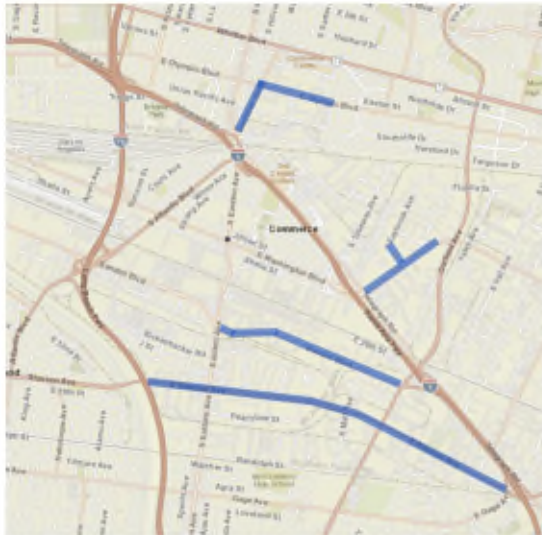
Project Locations NTS